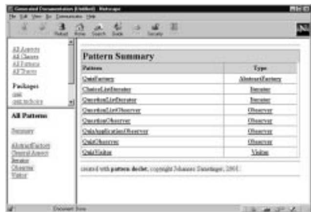
Fig. 2: Pattern Summary

In Fig. 2 we can see the start page of the system documentation of an application. In the top left panel we can see the entries "All Aspects", "All Classes", "All Patterns", and "All Traces". By clicking on the item "All Patterns", we get a list of patterns in the lower left panel. This panel provides a summary and a list of all patterns in the system. If we click on "Summary" we get the pattern summary as shown in the big right panel in Fig. 2. Here we can see a table with all patterns in the system as well as their type. In the pattern summary of Fig. 2, there are eight design pattern instantiations, one abstract factory, two iterators, four observers, and one visitor.